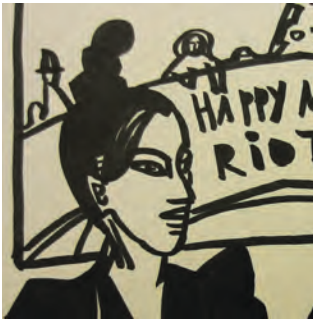
Joulia Strauss page 22 | drawing: V. Lomasko