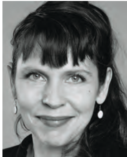
Birgitta Jónsdóttir page 17