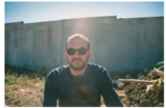
Artur Zmijewski page 25