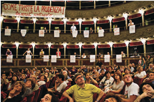
Teatro Valle, Rome, © Tiziana Tomasulo

On the 26th we want to screen the streamed performance made with Teatro Valle, and the detournement-action staged during the symposium. In this way we are seeking to create inside the museum a feeling of irritation and misplacement but also of inclusion; to understand together with the audience why activism is the first form of art of the third millennium.