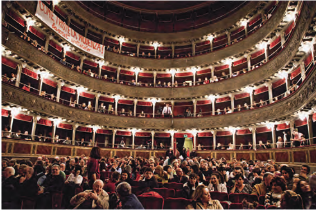
Teatro Valle, Rome