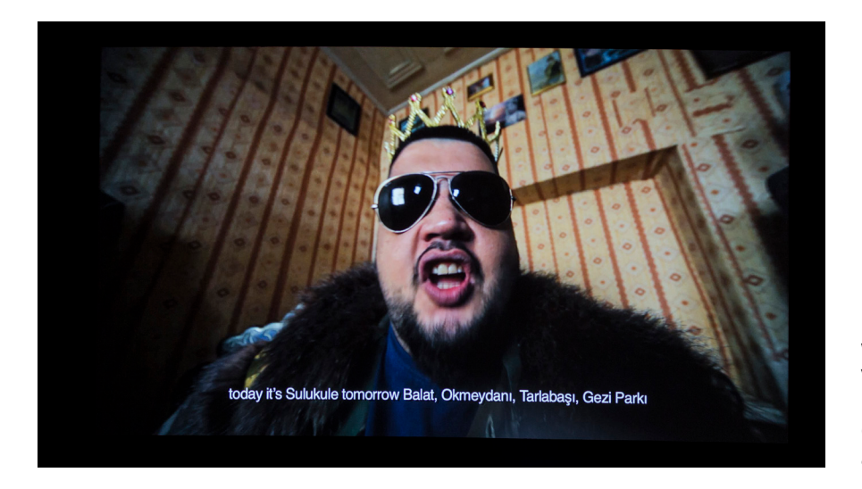
Halil Altindere Wonderland, 2013 Video, 8:25 min.

The platform was inspiring also for Tahribad-1 İsyan, the hip-hop band created by three youngsters in Sulukule, with whom Halil Altindere worked for Wonderland , which was one of the highlights of the previous Istanbul Biennial. Altindere's video is a document of anger and resistance, but also of hope and energy regarding Istanbul's adventure of concretion, gentrification, and sanitizing. In the video we see the potential of the resistance.