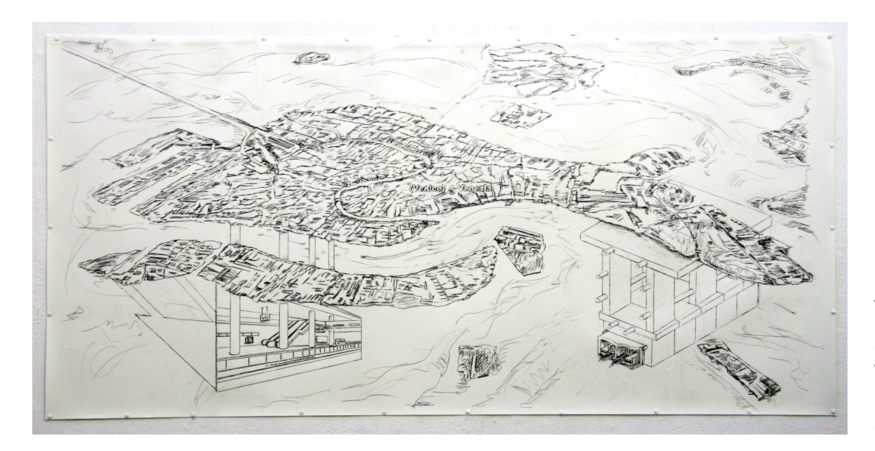
Luchezar Boyadjiev, Venice needs an Underground (2007) Cycle: "Utopian Solutions for Dystopian Cities" (2007 – in progress)

But of course going to Kassel every time-and this is the other kind of imposition on biennial cities-you travel and can think about cities where biennials happen from a different point of view. So I came up with this cycle of suggestions about cities: Kassel definitely needs an airport. It would make life a lot easier. These are my ideas for the on-going project "Utopian Solutions for Dystopian Cities." Another suggestion is how to support the islands of the Venice Biennale: You build a Venice Underground, because literally the tube can support the islands, and it would make moving around the venues of the Biennale a lot easier. So these are the suggestions for biennial and other kinds of cities: New York needs to sleep (a bed). Istanbul needs no split. Paris needs to reboot (an audience). Singapore needs to clone (a colony); it is such a good model for a society, I would urge you to colonize Bulgaria, for instance. Seoul needs a rest (for three days). Rome needs to forget. Moscow needs to grow up; it's very spread but needs to grow up ward. Berlin needs to shape up. Sofia needs to think. London needs to make room. And Jerusalem needs to ... I'm going to show you soon.