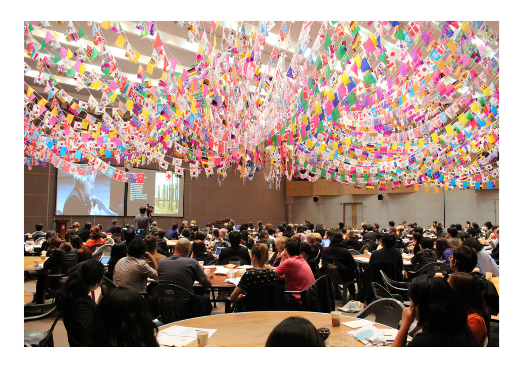
World Biennial Forum No 1: Shifting Gravity (2012), Gwangju, South Korea