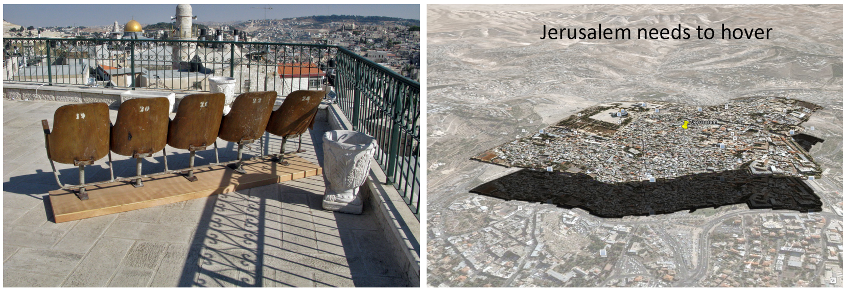
City with a View(s) (2008) At: The Jerusalem Show 0.1, 2008

My tour in Jerusalem was for the finissage, and I had this site-specific installation on a rooftop of a particular building near the Herod's Gate. It is called City with a View . There were several formations with cinema chairs trying to look at Jerusalem in a cinematic way, away from the center. This is a view to Mecca; the work belongs to the Museum of Contemporary Art of Palestine. Obviously in the background there is the Church of Nativity. There were two other formations looking into the direction of Moscow and New York.