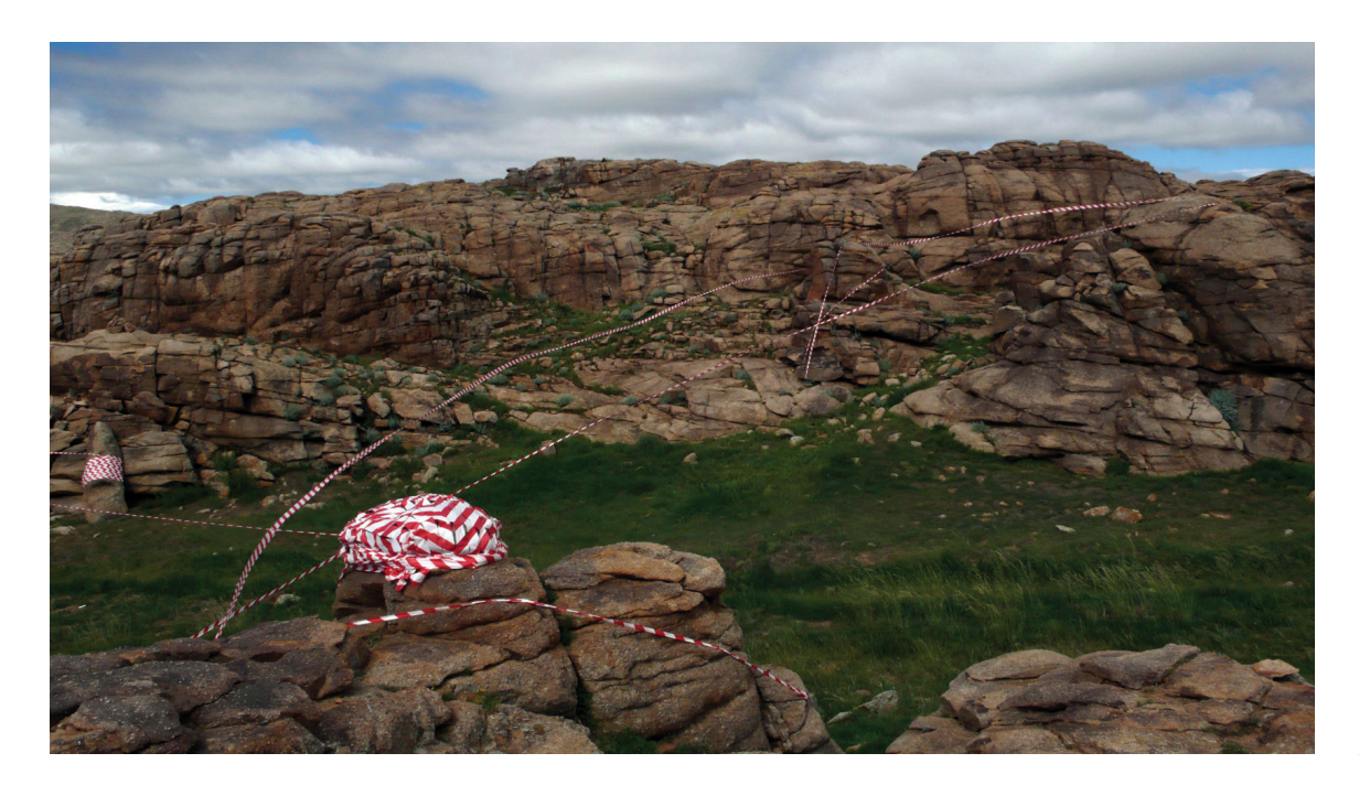
LAM 360°, Dolgor Ser'od, Natural Link (2010)

For better or worse, we've recently experienced a focus of biennials within their own regional contexts, as in Singapore, rather than looking globally. Some see it as an arrival of the local, respecting what is occurring in the region, rather than favoring the usual global players. Others have expanded their criteria to increase visibility, such as the Whitney Biennial, acknowledging that the United States is home to artists from all over the globe. Alternative biennials occur at less audience-attracting places, such as Land Art Mongolia (LAM 360°), which is actually not geared toward an audience at all. It rather allows artists to focus solely on their works out there in the nature of the vast Gobi Desert. Another example of this would be the Project Biennial of Contemporary Art, D-0 ARK Underground, in Bosnia and Herzegovina, situated at the previous military bunkers of Tito, a challenging venue for both artists and audiences alike. Some biennials have responded toward the criticism of appointing well-known curators from outside to determine what is new and relevant in the arts with a legion of local curators who investigate from within.